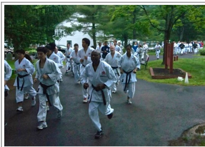
Each day at Master Camp begins with a warmup, a jog, and the first training of the day - all before breakfast!