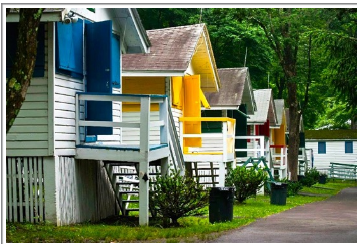
Colorful cabins at Master Camp adorn the campus of Camp Green Lane located in southeastern Pennsylvania, USA.