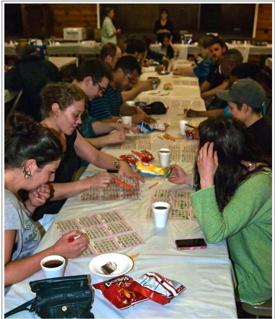
Game night participants competed for a slate of impressive top prizes, including calligraphy drawn by Master Yaguchi.