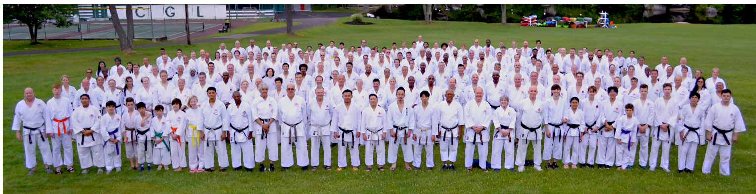
ISKF MASTER CAMP 2024 CAMP GREEN LANE PENNSYLVANIA, U.S.A.